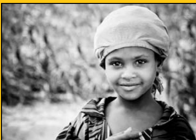
Young Ethiopian girl