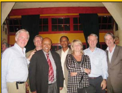
Reception hosted by Addis Ababa Chamber of Commerce