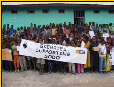
Ethiopian schoolchildren outside a new primary school which was built with the help of funds raised by the community of Skerries. Self Help Africa are the NGO implementing the programme