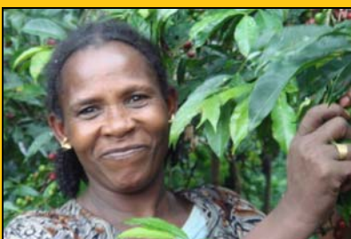
Coffee was first consumed in the 9 th century, when it was discovered in the "Kaffa" region in the highlands of Western Ethiopia.