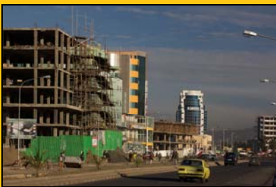
A lot of construction is taking place in the capital, Addis Ababa