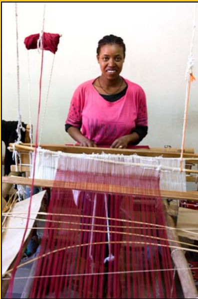
Hand looming textiles