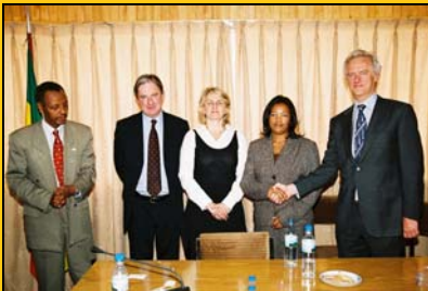
Presentation made to the Ethiopian Minister of Tourism during Connect Ethiopia's April 2008 trade mission

BB's Coffee and Muffins are very interested in becoming part of this initiative and remain committed to the project. They will visit Ethiopia and make direct contact with exporters before placing orders. A trip to Ethiopia's coffee growing regions will take place during 2009.