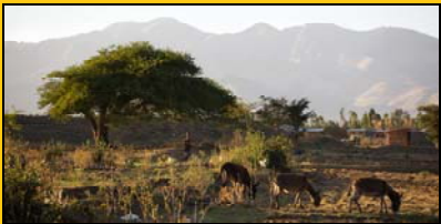
Ethiopia is a mountainous country