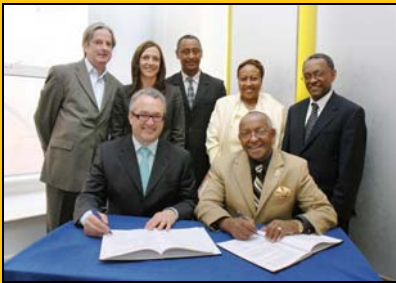
Signing of a Memorandum of Understanding between the Dublin Chamber of Commerce and the Addis Ababa Chamber of Commerce – May 2008