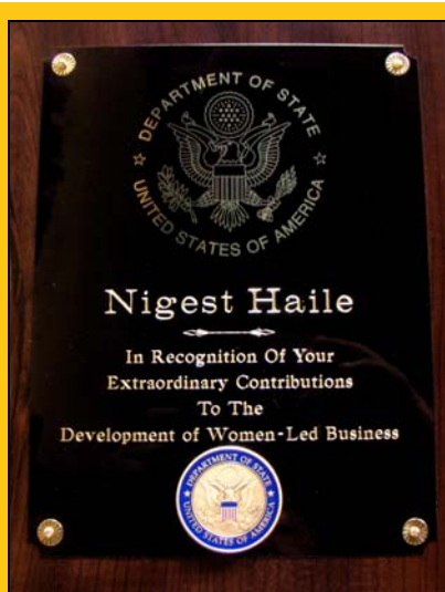
Awarded by the US Department of State – January 12 th , 2009